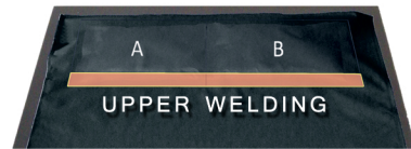
INTERNAL POUCH WITH 2 POCKETS A & B